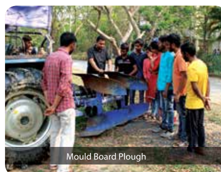
Mould Board Plough