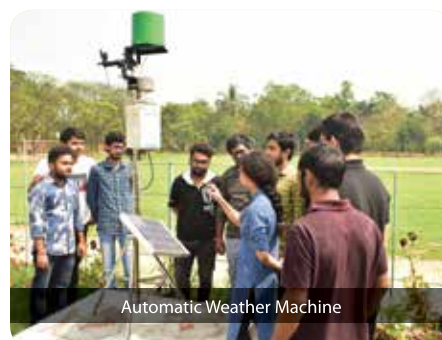
Automatic Weather Machine