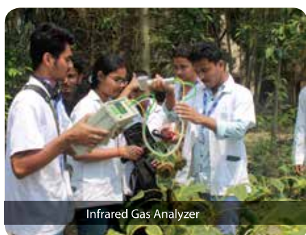
Infrared Gas Analyzer