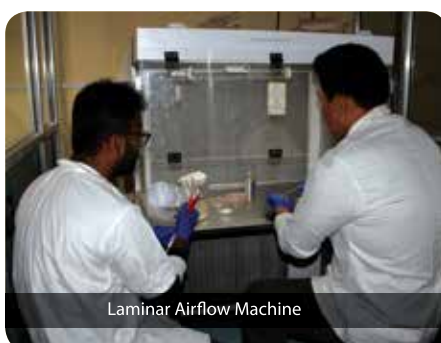
Laminar Airflow Machine