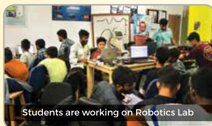
Students are working on Robotics Lab