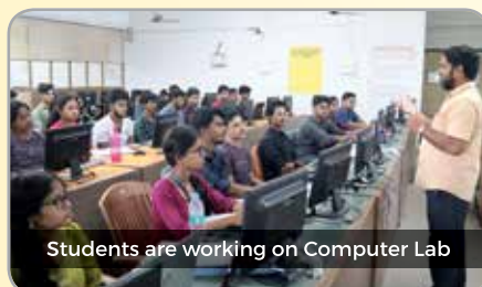
Students are working on Computer Lab