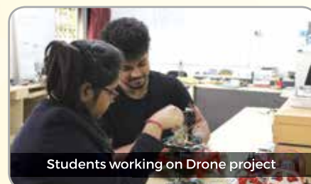
Students working on Drone project