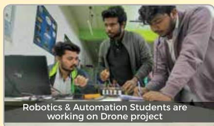
Robotics & Automation Students are working on Drone project