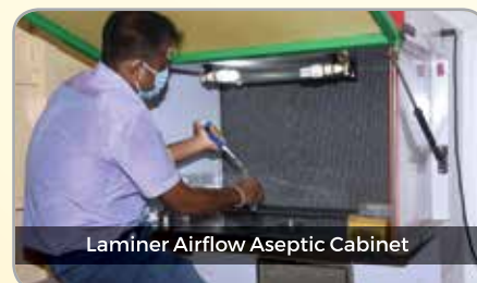
Laminar Airflow Aseptic Cabinet