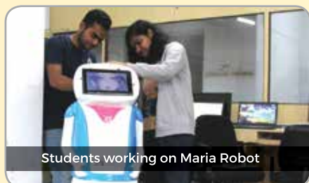
Students working on Maria Robot