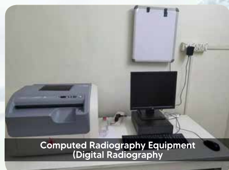
Computed Radiography Equipment (Digital Radiography)