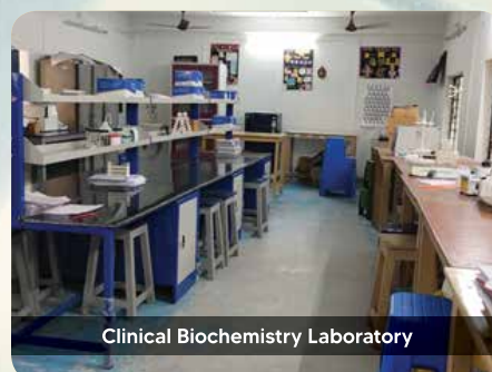
Clinical Biochemistry Laboratory