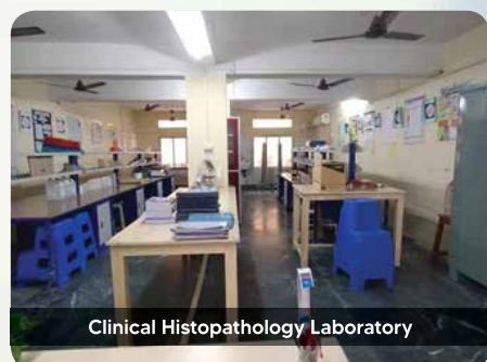
Clinical Histopathology Laboratory