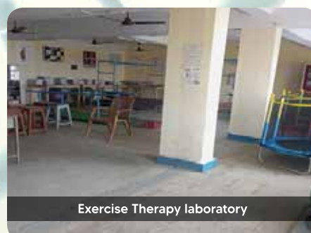
Exercise Therapy laboratory