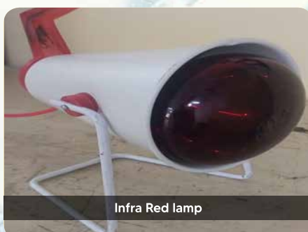
Infra Red lamp