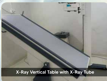
X-Ray Vertical Table with X-Ray Tube