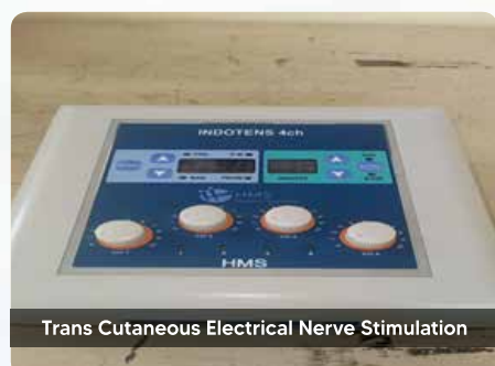
Trans Cutaneous Electrical Nerve Stimulation